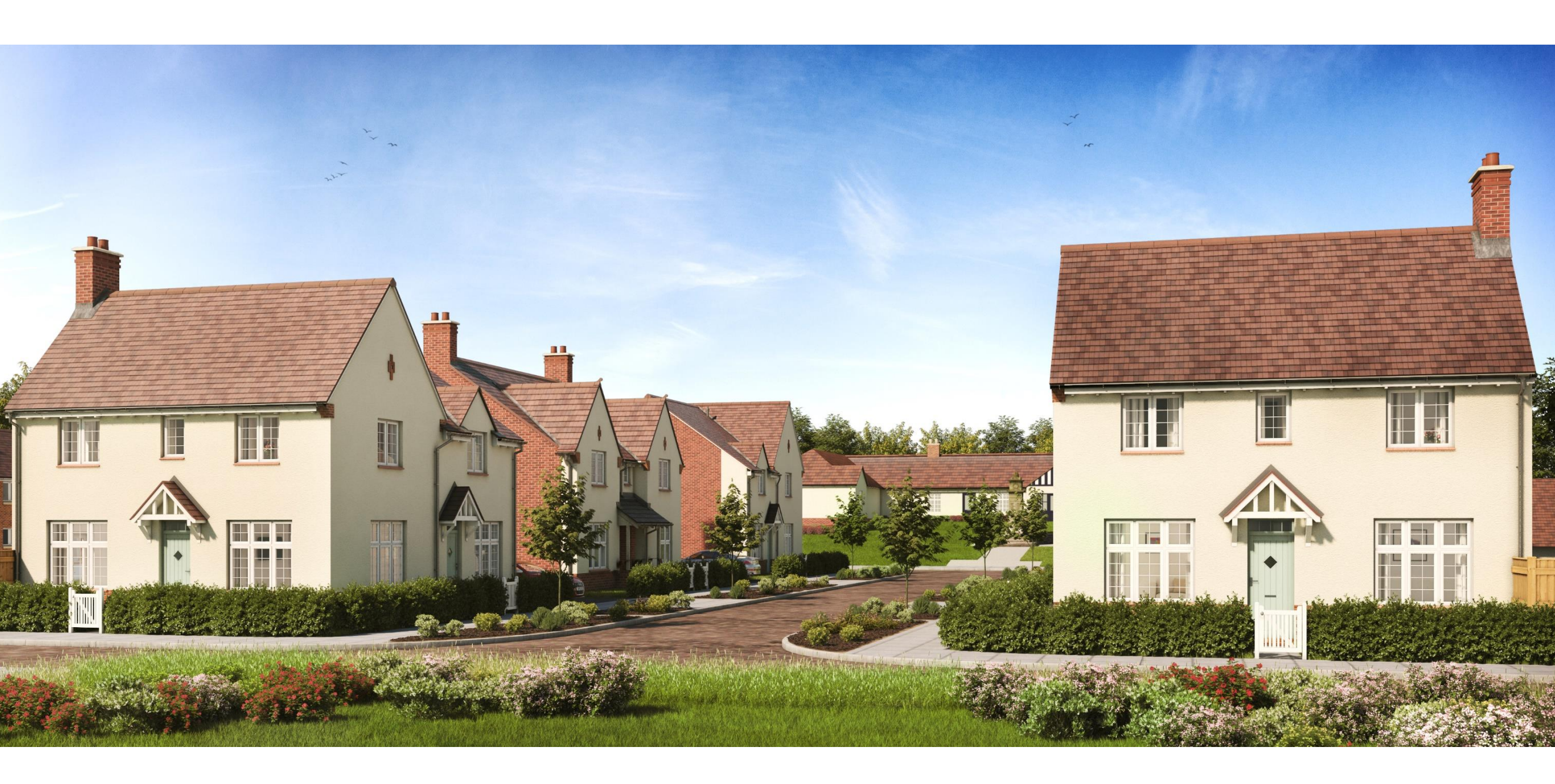
View from the green towards the War Memorial