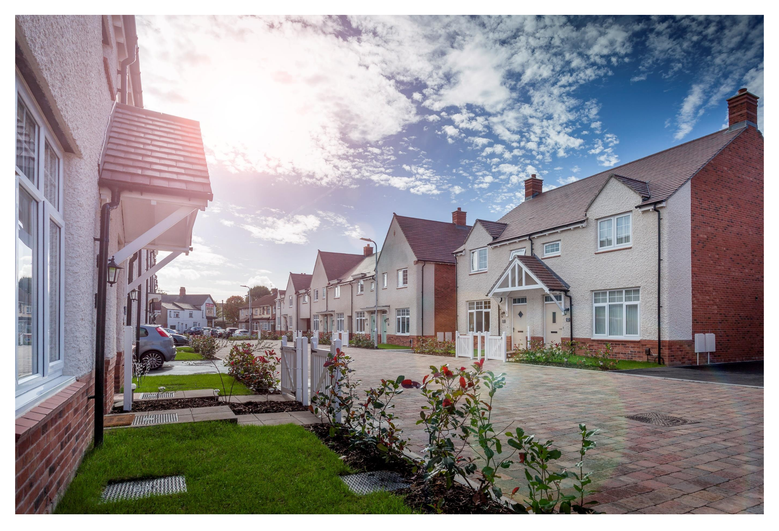
Photograph of Loftus Garden Village