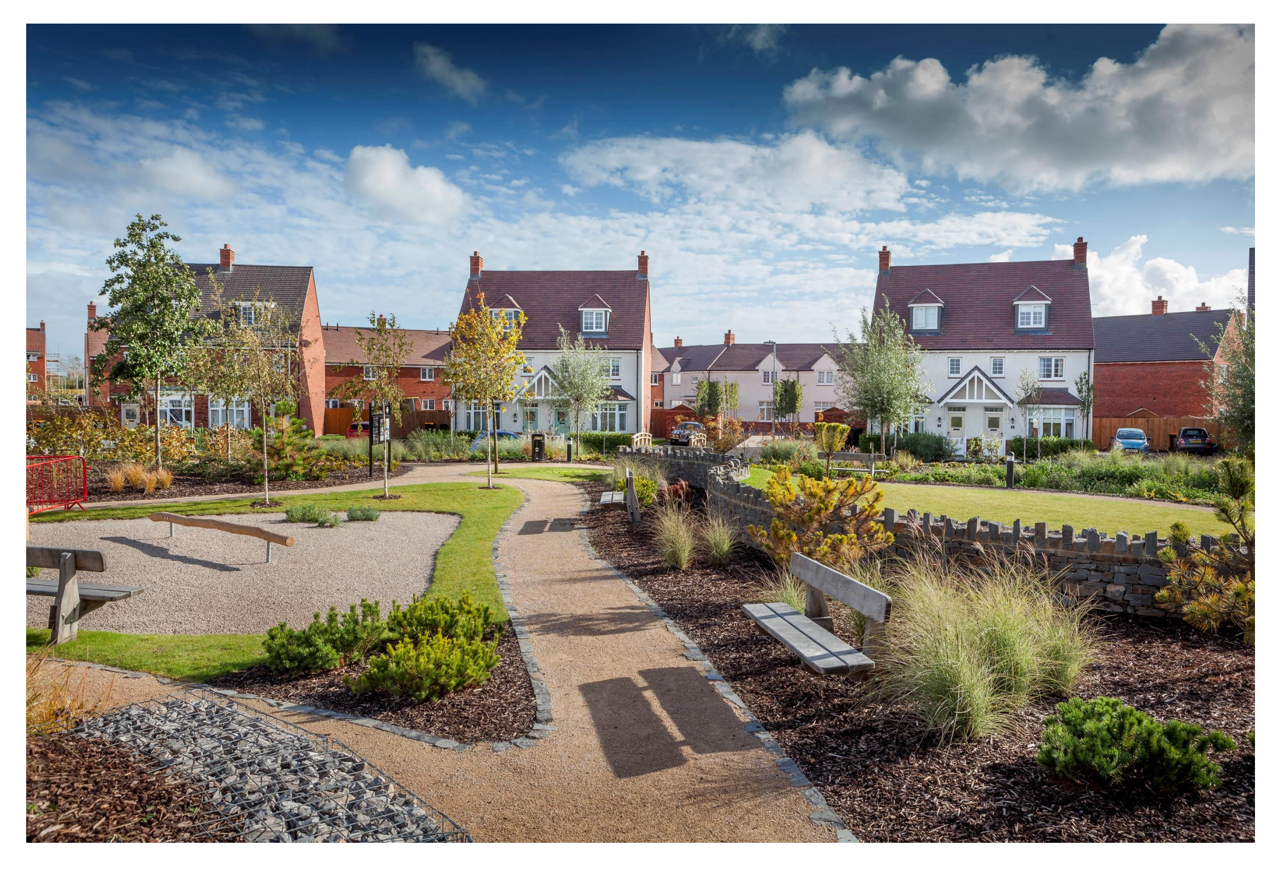
Photograph of Loftus Garden Village