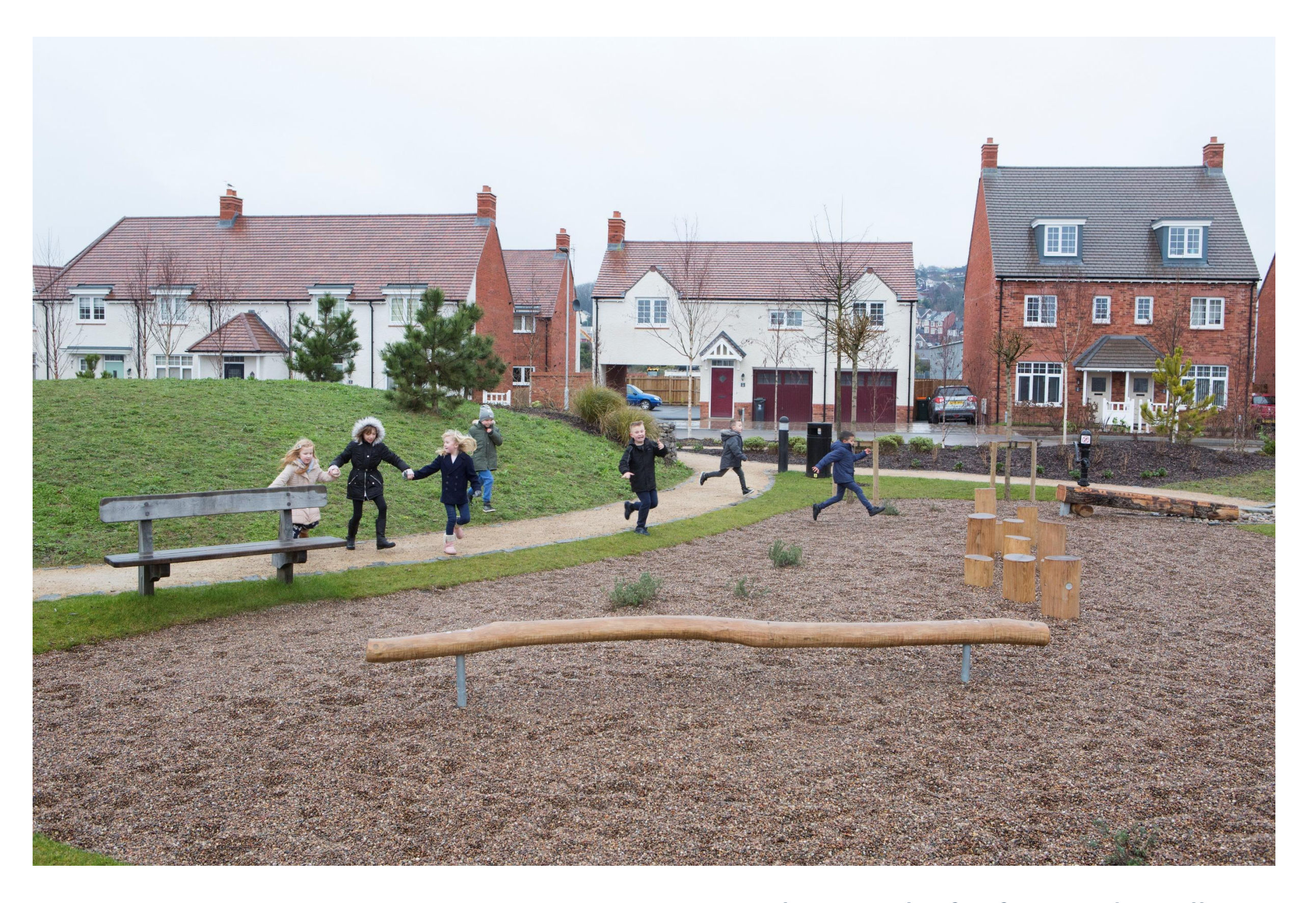
Photograph of Loftus Garden Village