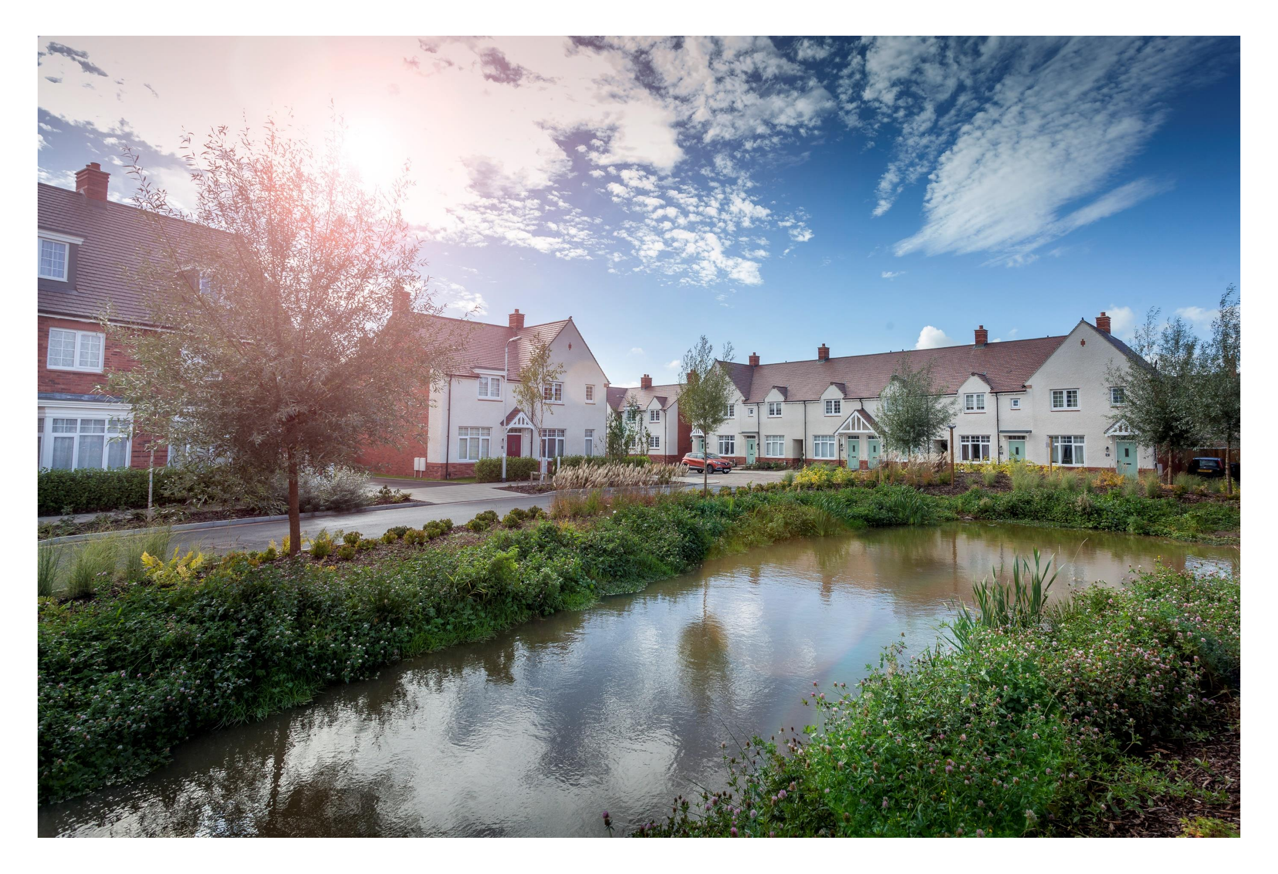
Photograph of Loftus Garden Village